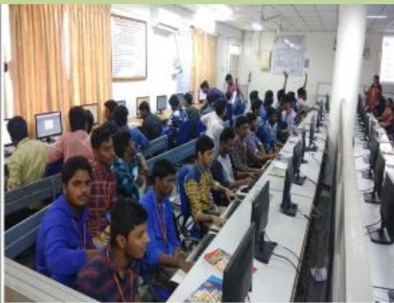
Students practising on Python