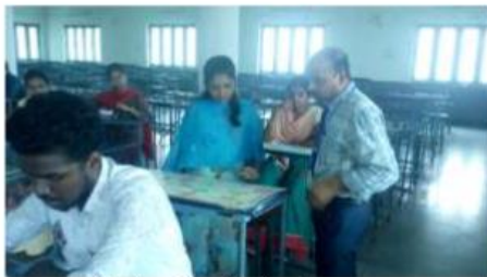
Student Explaining her poster