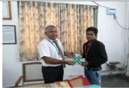
Prize Distribution by HOD