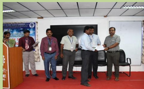
certificate distribution to the participants