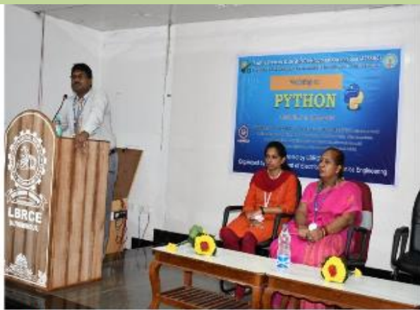
Addressing by Principal