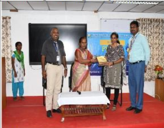
Felicitation of the Resource Person by HOD & Co-Ordinator-EEE