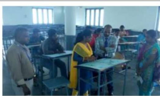
Student Explaining her poster